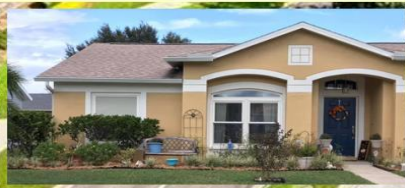
Sandy Trail Pl.