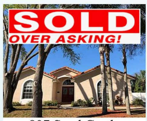
807 Sand Castle

I wanted to share some of my recent Brentwood Hills listings – including these 2 that I sold in less than 24 hours – and over asking price!