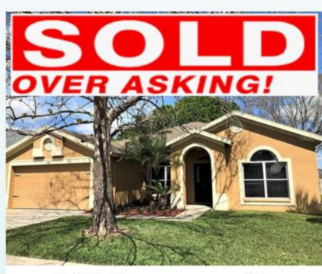
545 Tuscanny St.

If you are thinking of selling or just curious what your home is worth, please give me a call. I love talking real estate and can fill you in on what is happening.