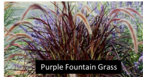
Purple Fountain Grass