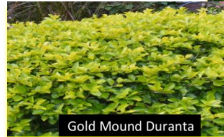
Gold Mound Duranta