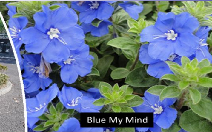
Blue My Mind