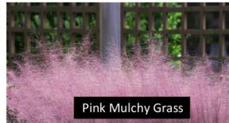
Pink Mulchy Grass