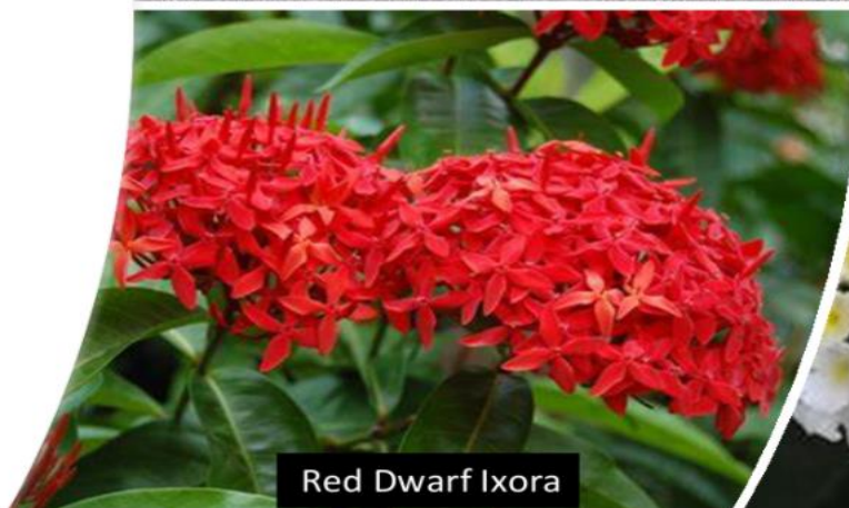
Red Dwarf Ixora